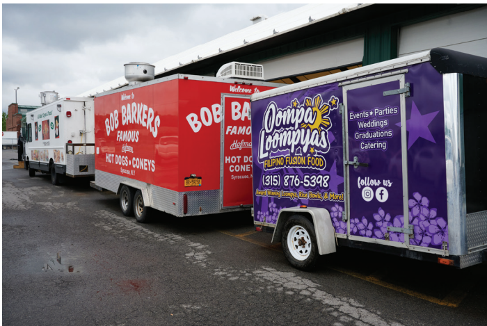
Food trucks offered new culinary options for attendees at this year's event, offering free samples as well as full menu items.