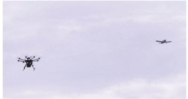
Drone and airplane sharing sky over Rome, New York.

The BVLOS flight operations will be performed by NUAIR at the New York UAS Test Site, one of just seven FAA-designated UAS test sites in the United States. The CAL technology will provide several key services enabling safe BVLOS operations within New York’s 50-mile UAS Corridor instrumented with radar, communication networks, including 5G and other leading-edge technologies that facilitate advanced drone operations.