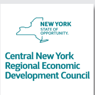
Applications for State Regional Council Funding Now Open