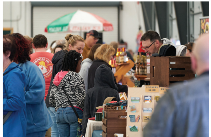
Hundreds of attendees sample locally made products while learning about local services at the Buy Local Bash.