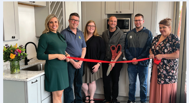
Raby's kitchen/bath , located at 249 Washington Blvd., Oswego, celebrates its showroom with a ribbon cutting to honor the grand opening of this extension to Raby's ACE Home Center.