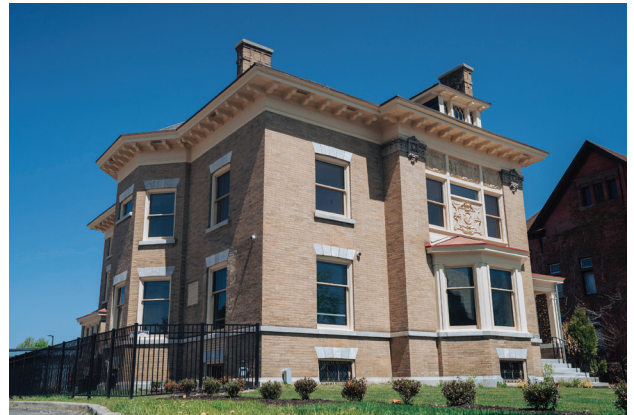
Pathfinder Bank's newest branch is located at 506 W. Onondaga St., Syracuse.

This feature of CEO Essentials spotlights local companies that are "Economic Champions" because of their success in adding jobs, expanding their products or services, gaining national recognition or contributing to the success of the region in special ways.