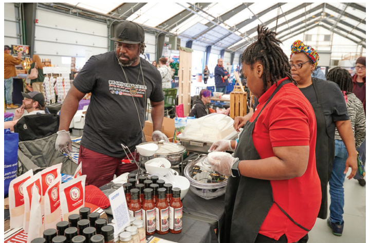
Neighborhood Chef puts the finishing touches on their samples. The Hot Honey Garlic Sauce was a crowd favorite. www.facebook.com/neighborhoodchefny