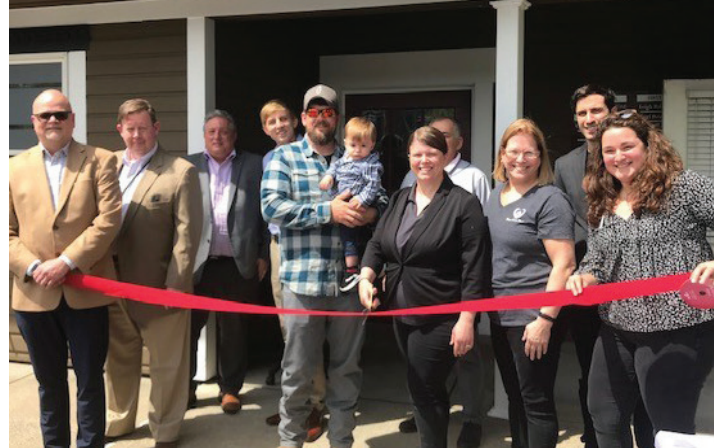
Home Sweet Home Cleaning & Gardening LLC , located at 100 E. Seneca St., Manlius, celebrates its new location.