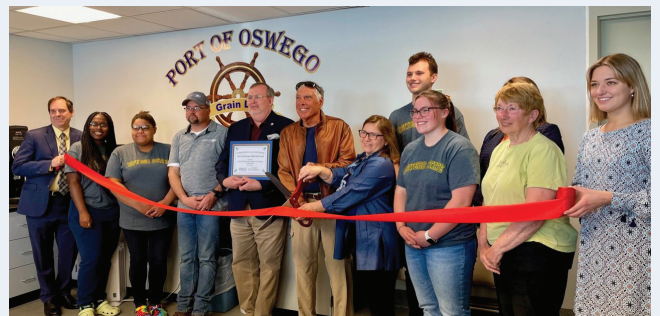
The Port of Oswego Authority, located at 1 E2nd St., Oswego, opened its new, state-of-the-art USDA Grain Lab. The Ambassador committee joined city officials, SUNY Oswego and the Port board of directors to commemorate the event.