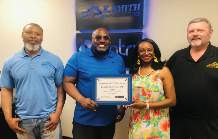
E. Smith Contractors , located at 108 W. Jefferson St., Suite 501, Syracuse, celebrate its new location.