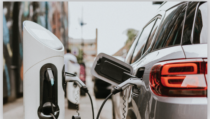
The Climate Leadership and Community Protection Act seeks to reduce greenhouse gas emissions to 85% below 1990 emissions levels by 2050, which will require significant changes to the products and technologies used in ones' personal lives and for business. Under the proposal, for example, new sales of light-duty vehicles must be zero-emissions by 2035. Learn more and comment.