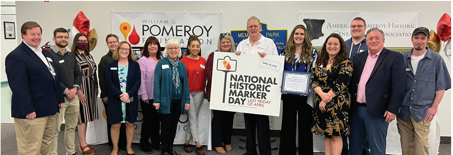
The William G. Pomeroy Foundation , located at 492 E. Brighton Ave., Syracuse, celebrates the one-year anniversary of National Historic Marker Day, along with its National Day Calendar recognition.