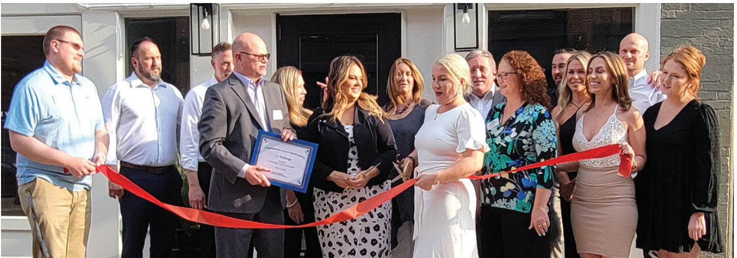
Le Mélange , located at 309 W. Fayette St., Syracuse, celebrates its grand opening.