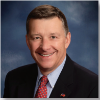
CEO Announces New Chair and Board Leadership

With its 331-page Draft Scoping Plan, New York's Climate Action Council lays out its initial framework for how the state will achieve an 85% reduction in greenhouse gas emissions from 1990 levels by 2050. This goal, with firm milestones along the way, is the result of the Climate Leadership and Community Protection Act (CLCPA), passed by the state Legislature in 2019.