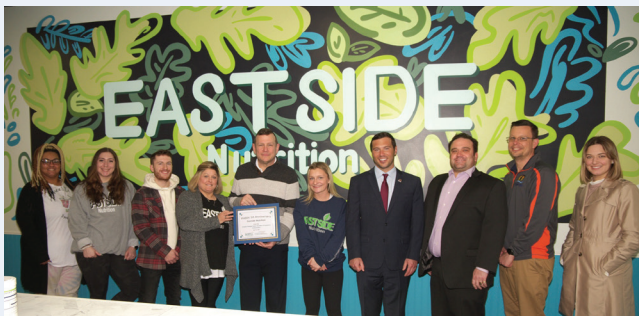
Eastside Nutrition , located at 293 NY-104, Oswego, celebrates its anniversary after opening amid the pandemic.