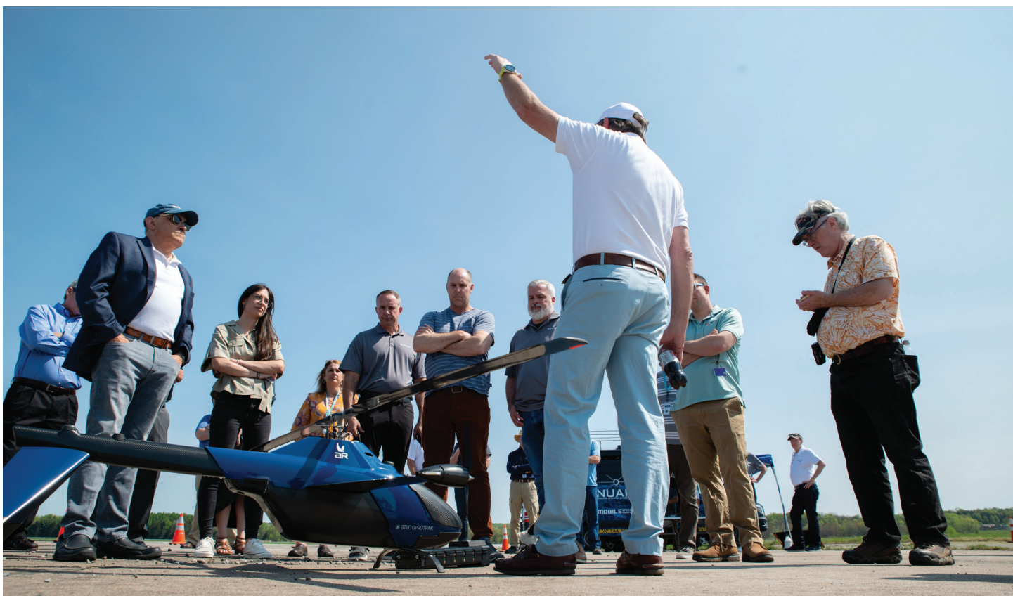
GENIUS NY Winner Aerial Robotics debuts its GT20 Gyrotrak, a hybrid UAV solution between a helicopter and gyrocopter, at the FAA-designated New York UAS Test Site at Griffiss International Airport managed by NUAIR in Rome, New York.

Aerial Robotics is currently in CenterState CEO's GENIUS NY accelerator, and was funded $500,000 in October 2021. The company has been successful in the U.S. and plans to bring manufacturing to New York state. GENIUS NY is the world's largest accelerator for uncrewed systems and to date as invested more than $15 million into 26 companies. The goal of the program is to attract and grow UAS technology companies in New York state. Learn more about Aerial Robotics.