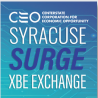
Surge XBE Exchange Seeks Members to Connect with XBE Startups