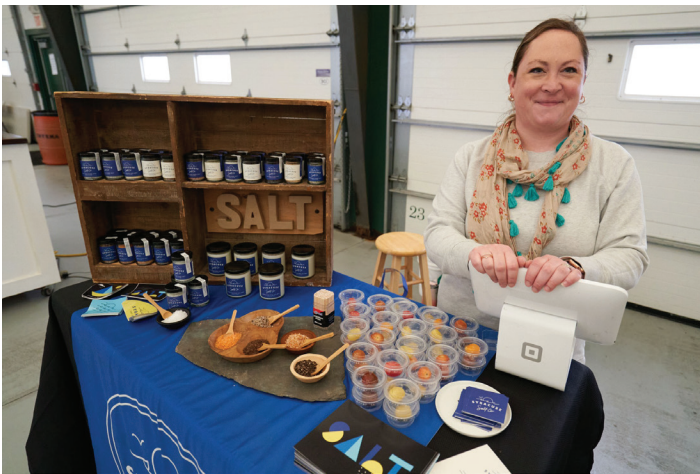
Syracuse Salt Co. is ready to share its creative, small batch, hand-finished salt at the 12th annual Buy Local Bash. http://syracusesaltco.com