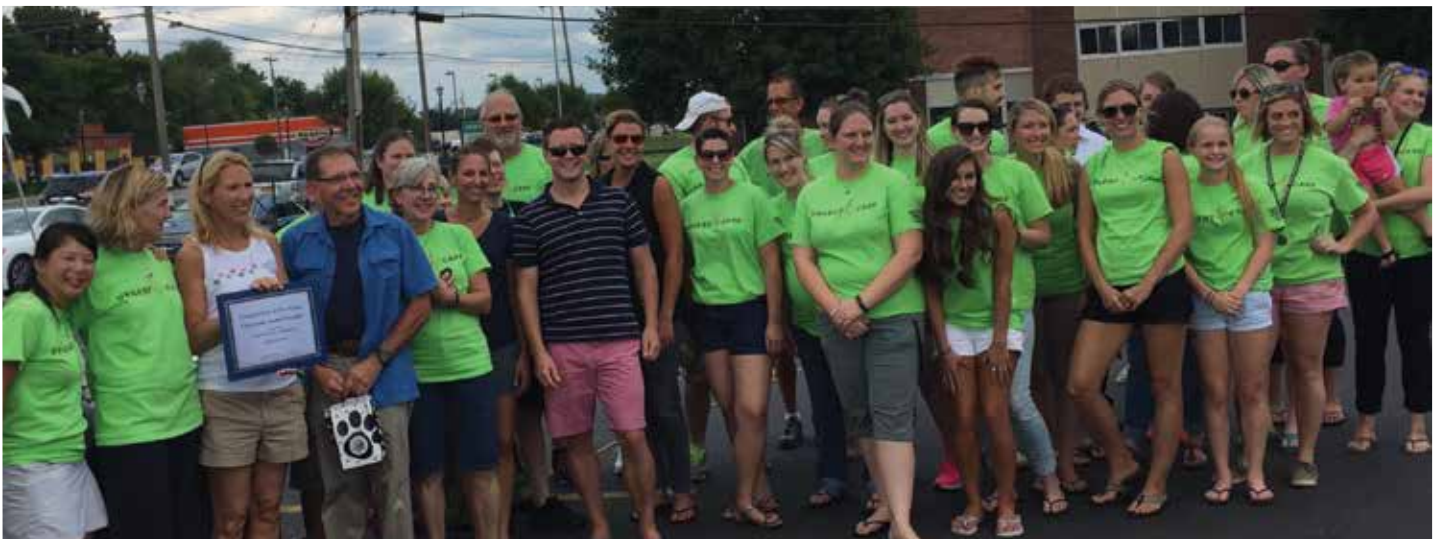
Fairmount Animal Hospital , 4101 W. Genesee St., Fairmount, celebrates its 50th anniversary.

Liftech Equipment Companies , 6847 Ellicott Drive, East Syracuse, renovates training center