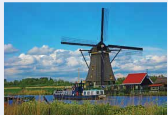
Kinderdijk Windmills, Holland

CenterState CEO invites travelers on a seven-night Springtime Tulip River Cruise featuring Dutch and Belgian Waterways, April 6 to 14, 2016 . Highlights include Amsterdam, Volendam, Arnhem, Middelburg, Ghent, Bruges, Antwerp, Kinderdijk Windmills and Keukenhof Gardens. River cruise tours feature small, intimate vessels for personal experiences as you travel the waterways. Trip includes round-trip airfare from Syracuse Hancock International Airport, seven-night cruise, and 20 meals: seven breakfasts, six lunches and seven dinners. Per person rates are: lower outside double $4,199; middle outside double $4,449; upper outside double $4,699; suite double $4,999. For additional information, contact Shannon Fults at 315-470-1884 or sfults@centerstateceo.com