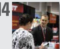
CenterState CEO Events: B2B Marketplace & Economic Champion Luncheon