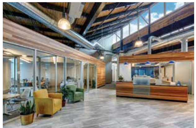
The newly renovated OneGroup Center features open work areas to allow for collaboration among employees and experts.

This feature of CEO Essentials spotlights local companies who are “Economic Champions” because of their success in adding jobs, expanding their products or services, gaining national recognition or contributing to the success of our region in special ways.