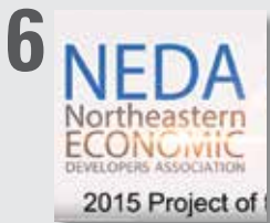
Tech Garden Receives NEDA 2015 Best Practice Award