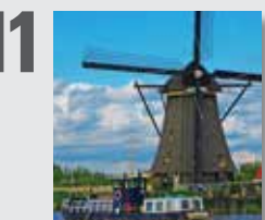
Enjoy a Holland and Belgium River Cruise Next Spring