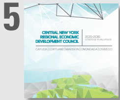
CNY Regional Council Recommends 45 Projects