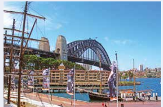
Sydney Harbour Bridge, Australia