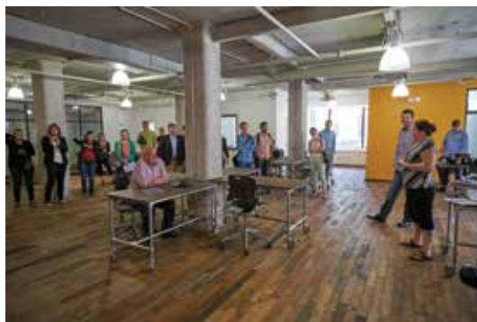
Attendees visit the Syracuse CoWorks space for independent workers, entrepreneurs and freelancers, as part of the TTG10 Corri-Tour.