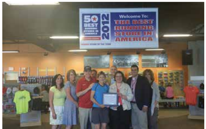
Fleet Feet celebrates its 15th anniversary! The store is located at 5800 Bridge St. in East Syracuse.