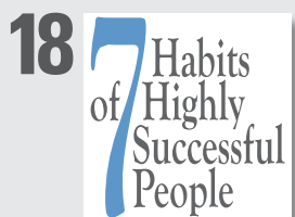
18 CenterState CEO Events: 7 Habits & More!