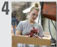
4 Work Train Launches Manufacturing Program