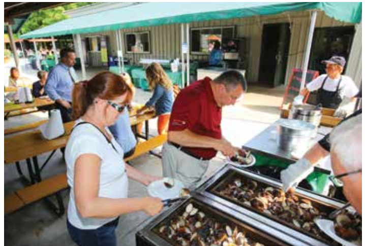
CenterState CEO members enjoys endless clams at Hinerwadel's Grove in North Syracuse.