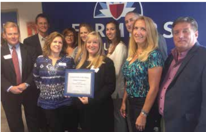
Farmers Insurance celebrates its new offices at 7085 Manlius Center Road in East Syracuse.