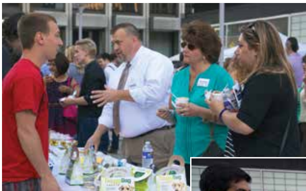
Full Circle Feed, a Tech Garden resident, displays its Doggy Bag Treats – made from high quality food leftovers – at Tech Meets Taste.