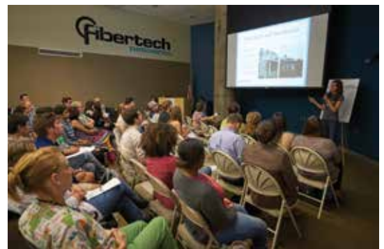
HoverStat presents during the LaunchNY TTG10 pitch competition, ultimately winning the $500 prize.