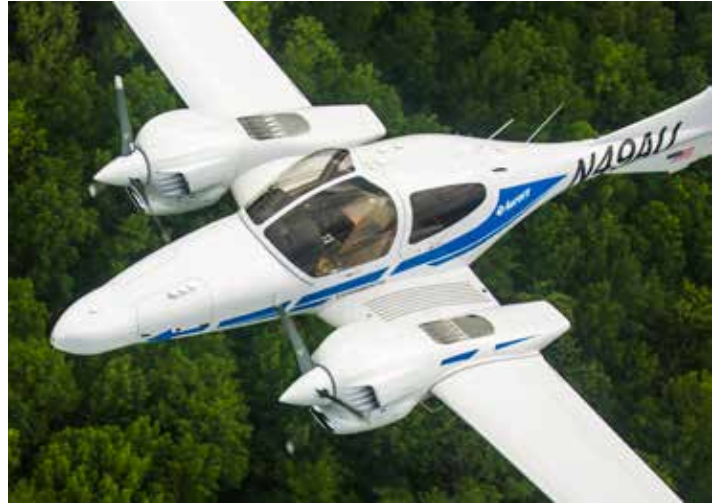
Aurora Flight Sciences successfully flew multiple unmanned test flights of the company's Centaur optionally piloted aircraft (OPA) from Griffiss International Airport in Rome, New York. The successful test flights marked the first time a large scale, fixed wing aircraft has flown at any of six FAA-designated unmanned aircraft test sites in the U.S.

NUAIR is one of just six FAA UAS test sites in the U.S. designated to conduct research aimed at safely integrating unmanned systems into national airspace.