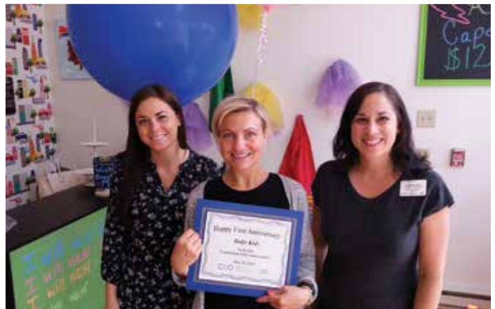
Indie Kids , 264 ½ W. Jefferson St., celebrates its first anniversary.