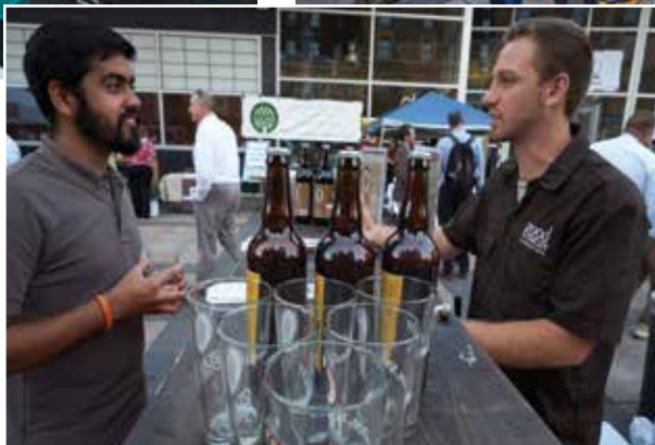
Good Nature Farm Brewery, of Hamilton, traveled to Syracuse to showcase its American Brown Ale.