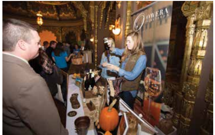
Owera Vineyards, of Cazenovia, was one of more than 90 businesses at the 2014 Buy Local Bash, which more than 1,000 people attended.