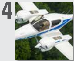
4 NUAIR Alliance Industry Days: September 22 and 23