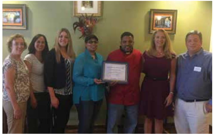
Creole Soul Café celebrates its grand opening at 128 E. Jefferson St., Syracuse.