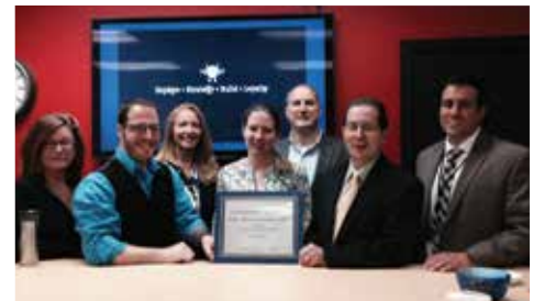
Gaber Marketing Studios, LLC, located in The Tech Garden, celebrates its second anniversary.

Check out the app at http://tinyurl.com/pyrrvgz .