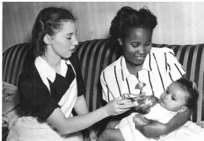
VNA has provided care for more than 100 years.