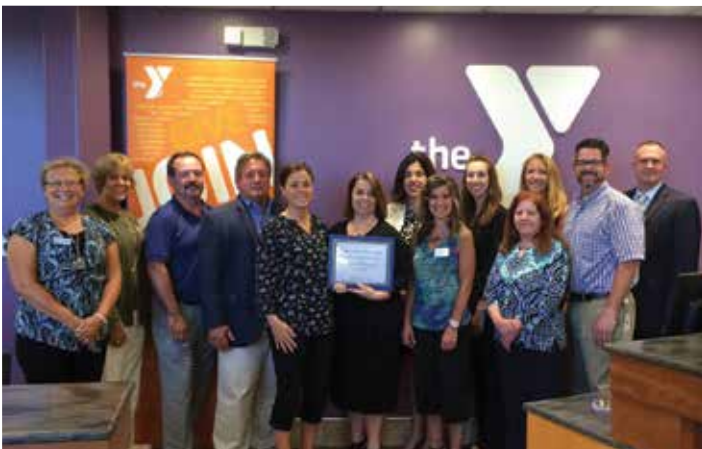
CenterState CEO Ambassadors tour the new YMCA located in Baldwinsville at 8040 River Road as it celebrates the Y's grand opening.