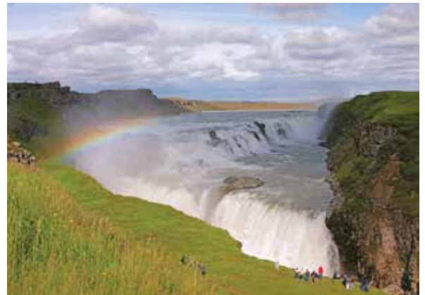
Rainbow at Gullfoss Waterfall, Iceland.

Discover Iceland's Magical Northern Lights with CenterState CEO, February 20 to 26, 2018. Highlights include Reykjavik, Northern Lights Cruise, Golden Circle, Thingvellir National Park, Geysir, Gullfoss, Seljalandsfoss, Vik, Eyjafjallajokull Volcano Visitor Center, Skogar Museum, Skogafoss, Jokulsarlon Glacial Lagoon, Skaftafell National Park, Vatnajokull Glacier and Blue Lagoon. Per person rates: $3,429 (double) and $3,929 (single). Price includes a $200 air booking bonus (if booked by August 20, 2017), round-trip airfare from Syracuse Hancock International Airport, air taxes, airport-hotel transfers, tour manager and 10 meals.