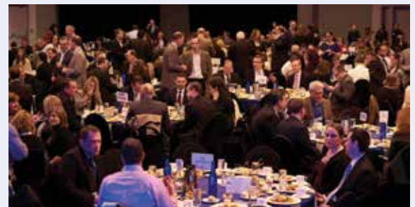
Attendees at CenterState CEO's 2016 Annual Meeting and Business of the Year Awards.