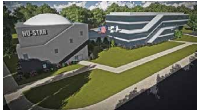
An artist's rendering of the proposed NUSTAR facility.