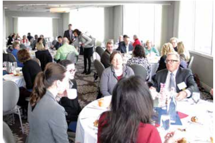
Tourism industry leaders from Albany and Central New York gather at the Crowne Plaza Syracuse hotel to address ways to boost tourism industry growth in the region.

The meeting was held during the annual Onondaga County Legislative Breakfast and sponsored by the New York State Hospitality & Tourism Association, Greater Syracuse Hospitality & Tourism Association and Visit Syracuse, at the Crowne Plaza Syracuse.