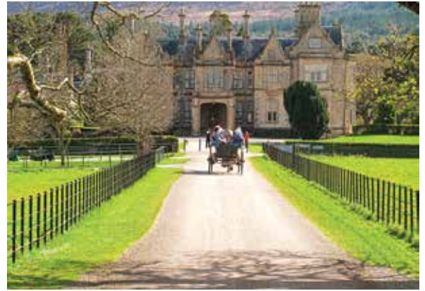
Killarney Muckross House, Ireland.

CenterState CEO presents Shades of Ireland, featuring Northern Ireland. This journey will take place September 5 to 17, 2017. Highlights include Dublin, Kilkenny, Waterford Crystal, Blarney Castle, Killarney, Ring of Kerry, Limerick, Cliffs of Moher, Galway, Donegal Town, Derry, Giant's Causeway, Glens of Antrim and Belfast. Per person rates: $4,249 (double) and $4,749 (single). Price includes round-trip airfare from Syracuse Hancock International Airport, air taxes, airport-hotel transfers, tour manager and 17 meals.