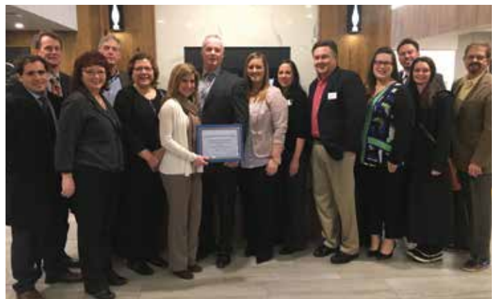
New hotel property Homewood Suites by Hilton-Syracuse/Carrier Circle , 6006 Fair Lakes Road in East Syracuse, celebrates its first anniversary.