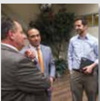
CenterState CEO Events