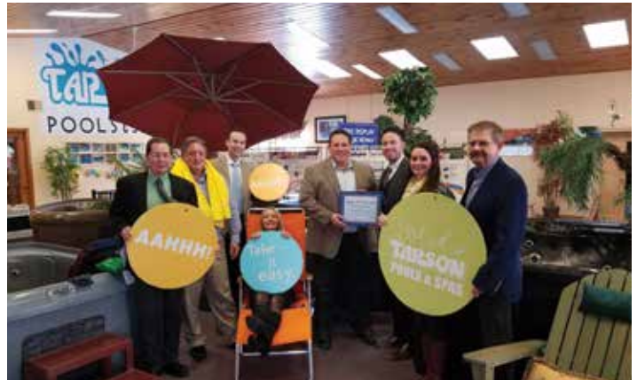
It looks like summer at Tarson Pools & Spas , 6071 E. Taft Road in North Syracuse. Tarson recently celebrated its 75 th anniversary.