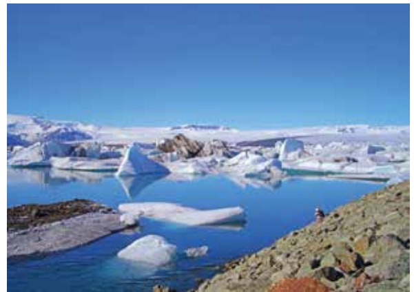
Jokulsarion Glacial Lagoon, Iceland

Discover Iceland's Magical Northern Lights with CenterState CEO, February 20 to 26, 2018. Highlights include Reykjavik, Northern Lights Cruise, Golden Circle, Thingvellir National Park, Geysir, Gullfoss, Seljalandsfoss, Vik, Eyjafjallajokull Volcano Visitor Center, Skogar Museum, Skogafoss, Jokulsarlon Glacial Lagoon, Skaftafell National Park, Vatnajokull Glacier and Blue Lagoon. Per person rates: $3,429 (double) and $3,929 (single). Price includes a $200 air booking bonus (if booked by August 20, 2017), round-trip airfare from Syracuse Hancock International Airport, air taxes, airport-hotel transfers, tour manager and 10 meals.