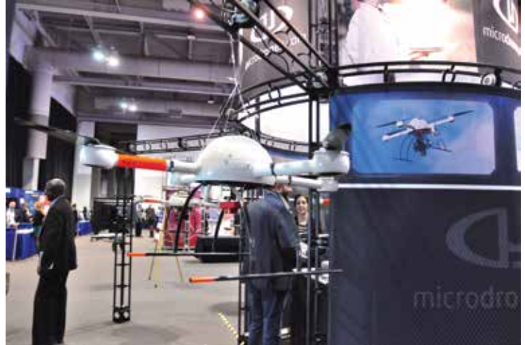
A Microdrones md4-1000 is displayed at the 2016 UTM Convention in Syracuse last November.