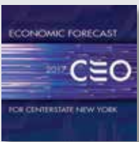
Economic Forecasters Predict Modest Growth Trends in 2017