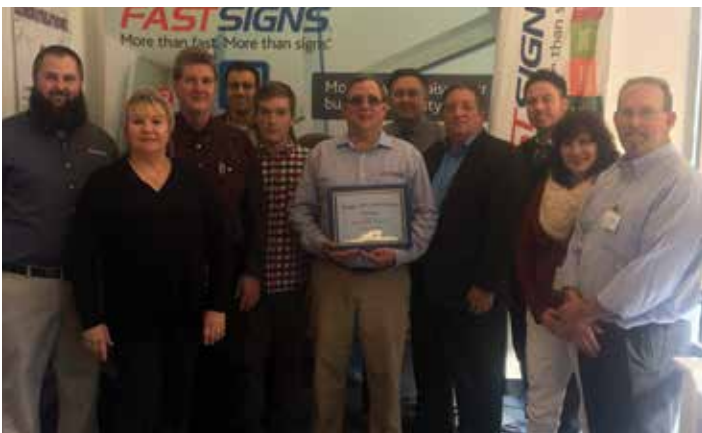
FastSigns , 2043 Erie Blvd. E. #2, celebrates its fifth anniversary.