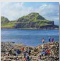
CenterState CEO Offers Two New Trips: Ireland and Iceland