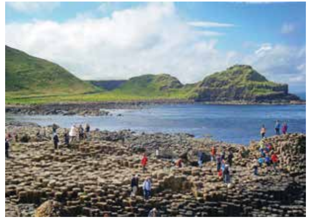
Giant's Causeway, Northern Ireland

CenterState CEO presents Shades of Ireland, featuring Northern Ireland. This journey will take place September 5 to 17, 2017. Highlights include Dublin, Kilkenny, Waterford Crystal, Blarney Castle, Killarney, Ring of Kerry, Limerick, Cliffs of Moher, Galway, Donegal Town, Derry, Giant's Causeway, Glens of Antrim and Belfast. Per person rates: $4,149 (double) and $4,649 (single). If booked before March 5, 2017 this price includes a $100 air booking bonus. Price includes round-trip airfare from Syracuse Hancock International Airport, air taxes, airport-hotel transfers, tour manager and 17 meals.