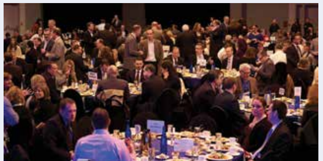
Attendees at CenterState CEO’s 2016 Annual Meeting and Business of the Year Awards.

Nicholas J. Pirro Convention Center at Oncenter