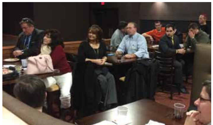
CenterState CEO Ambassadors celebrate the holidays with a party at Revolutions at Destiny USA. Ambassadors collected $328 in donations for Make-A-Wish of Central New York.