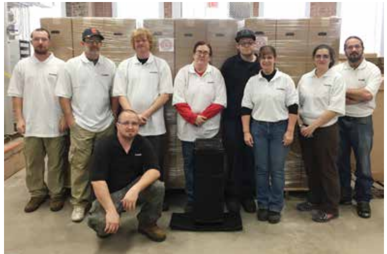
The Intellipure Ultrafine 468 is surrounded by HealthWay's committed production team of its new product line.