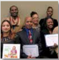
Start It! Graduates Introduce New Business Concepts to the Region