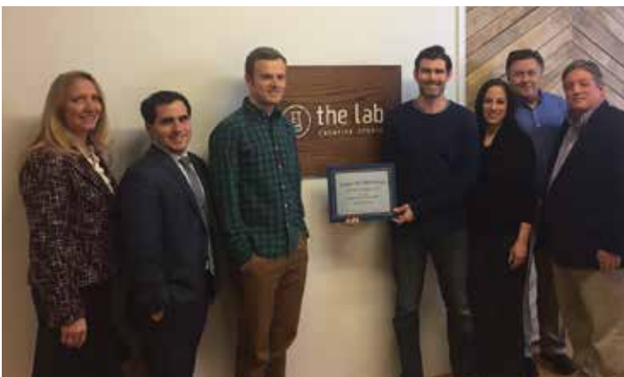
The Lab Creative, LLC , 509 W. Fayette St., celebrates its first anniversary.