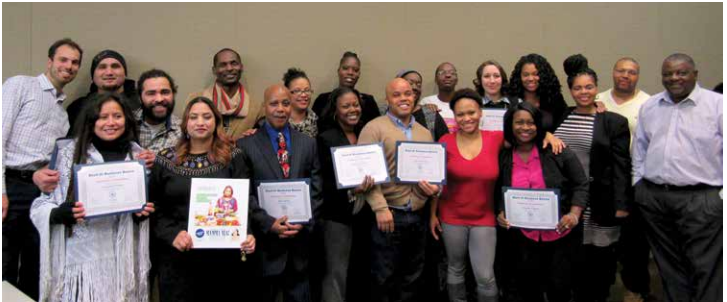
Recent graduates of the Start It! Business Basics Class celebrate completion of the program.

The next Start It! classes begins this month. To enroll or learn more, contact Dan Cowen at DCowen@CenterStateCEO.com or 315-480-7690. Start It! is one component of Up Start, a collaborative business development program housed within CenterState CEO that connects existing businesses and aspiring entrepreneurs to the tools and networks that help them thrive.