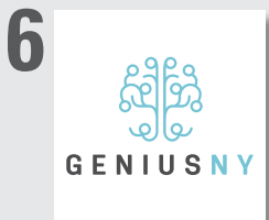
6 GENIUS NY 2.0 Announces Six Finalists Competing for $3 Million