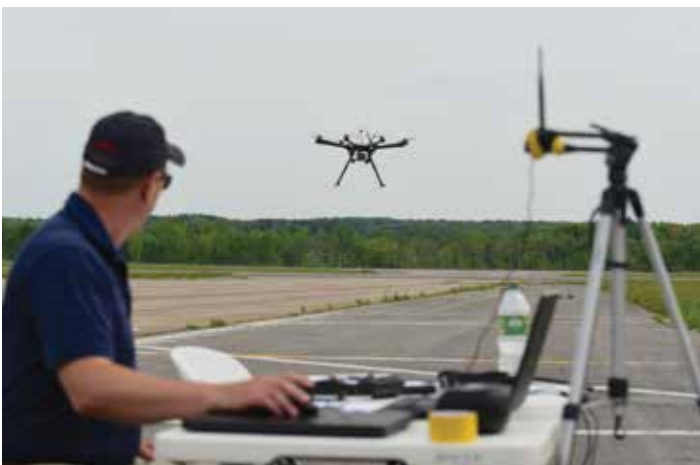
The NUAIR Alliance tests unmanned aircraft systems focused on beyond visual line-of-sight operations in preparation for a flight test demonstration in conjunction with NASA earlier this year.