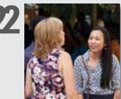
22 CenterState CEO Events