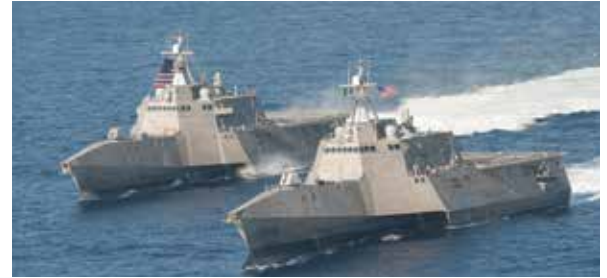
Saab's Sea Giraffe Radar installed on Independence Class littoral combat ships.

This feature of CEO Essentials spotlights local companies that are "Economic Champions" because of their success in adding jobs, expanding their products or services, gaining national recognition or contributing to the success of the region in special ways.