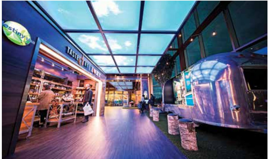
The new Central New York Welcome Center inside Destiny USA is open. Visitors can purchase local products, design trip itineraries and test their knowledge of the area.

The Welcome Center inside Destiny USA is one of 11 being built throughout the state. The centers advance Governor Cuomo's goal of growing the state's tourism industry by promoting local attractions, food and beverage producers and the region's agritourism destinations.