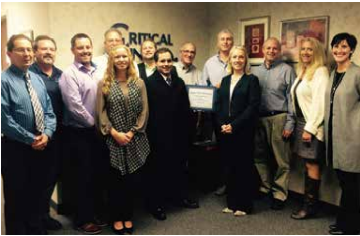
Critical Link LLC , 6712 Brooklawn Parkway, Syracuse, celebrates a milestone anniversary – 20 years!