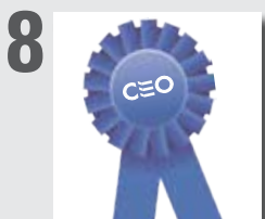
8 Nominate 2018 Business of the Year