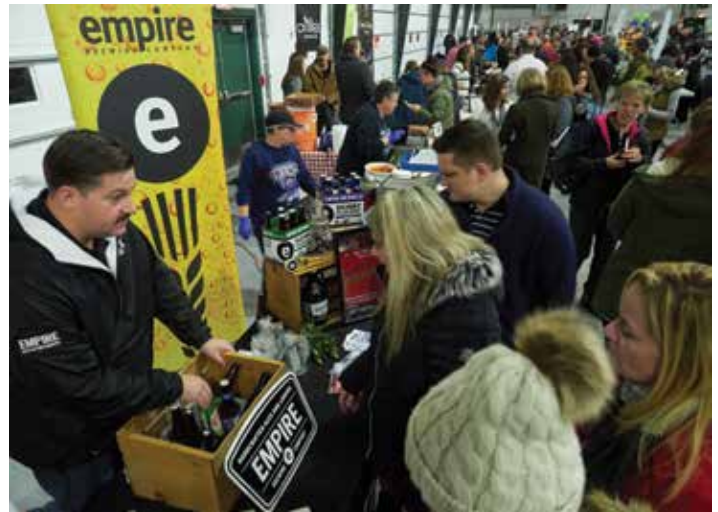
The Empire Brewing Co. provided free samples of their handcrafted ales and lagers.

The Buy Local Bash wouldn’t be possible without the support of its sponsors: AmeriCU (Presenting Sponsor); BlueRock Energy (Beverage Cup Sponsor); China Towne Furniture and Mattress (Lounge Sponsor); KMase Productions (Local Music Sponsor); The Lab Creative (Local Agency Sponsor); HighPoint Advisors and The Marrone Law Firm (Neighbor Champion Sponsors); CSM Finishing, Greater Syracuse Association of Realtors/CNYRealtor.com and CH Insurance (Sustainable Business Sponsors); Galaxy Communications/KROCK (Radio Sponsor); WSYR/News Channel 9 (TV Sponsor); WAER and Syracuse Woman Magazine (Media Sponsors).