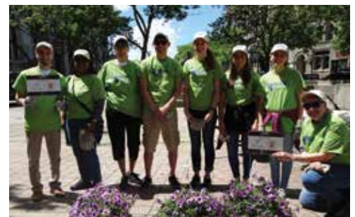
The 2017 Partners in Planting season was a partnership between The Bonadio Group, Young Leaders United, Pioneer Companies and the Downtown Committee.

Employers who want to engage employees in downtown's revitalization can support the Downtown Committee's Partners in Planting program, now in its fourth year. The Partners in Planting Program was developed to bolster pride and engage downtown employees in the neighborhoods they work. By transforming downtown's landscape through beautification and clean-up efforts, participants give back to the community by investing in the quality of life downtown Syracuse presents. Get involved to ensure downtown Syracuse stands out as an attractive destination by contacting mail@downtownsyracuse.com or 315-422-8284, or visit http://downtownsyracuse.com/flowers .