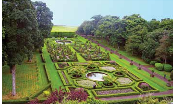
The gardens of Dunrobin Castle in Scotland.