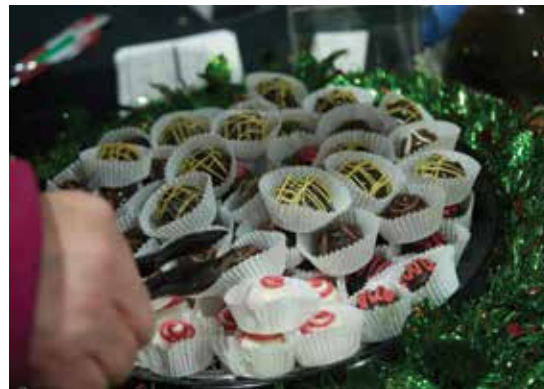
The Speach Family Candy Shoppe, family owned and operated for four generations, shared free samples of their truffles.