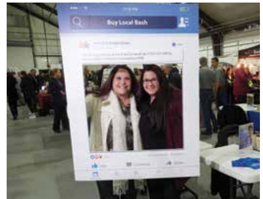
Special thanks to Presenting Sponsor AmeriCU for supporting the Buy Local Bash.