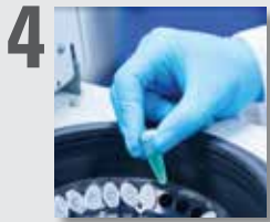
4 CNY Regional Council Receives Largest Award Across State

Partners in Central New York and the Mohawk Valley are making significant progress creating a hub for unmanned systems innovations in Upstate New York. Most recently, and in partnership with Empire State Development, partners