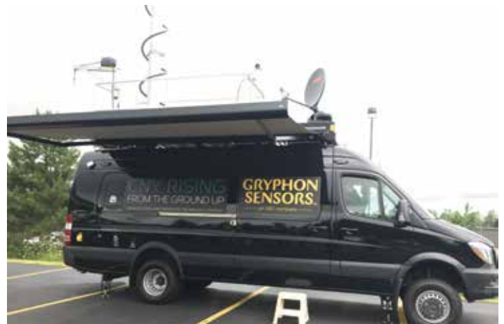
GrYPHON Sensors utilizes a mobile UTM unit to demonstrate phase 1 of Project U-SAFE, which makes beyond visual line of sight technology available in a 5-mile loop around Griffiss Air Force Base, in Rome.