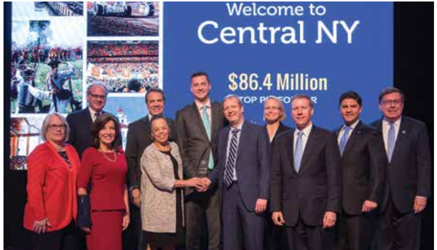
Members and supporters of the CNY Regional Economic Development Council celebrate its big win of $86.4 million to assist 112 projects.