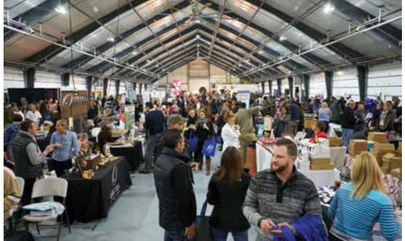
More than 800 people visited more than 100 independently owned vendors at the 2015 Buy Local Bash at the CNY Regional Market.