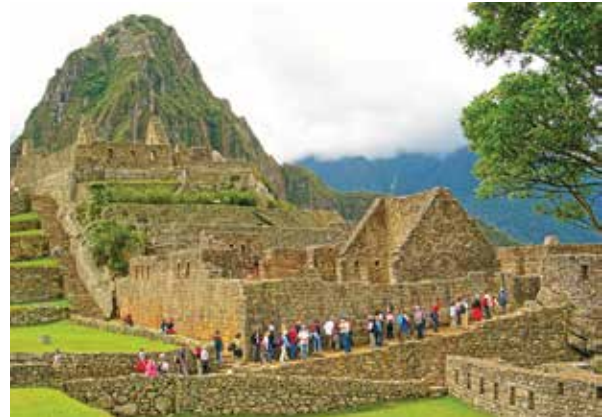
Visit some of the world's most ancient ruins on a trip to Peru in early 2017.