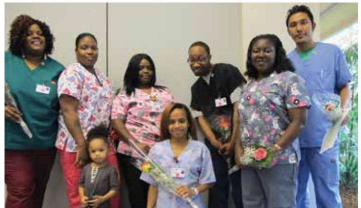
Health Train graduates are ready for employment in the health care field.