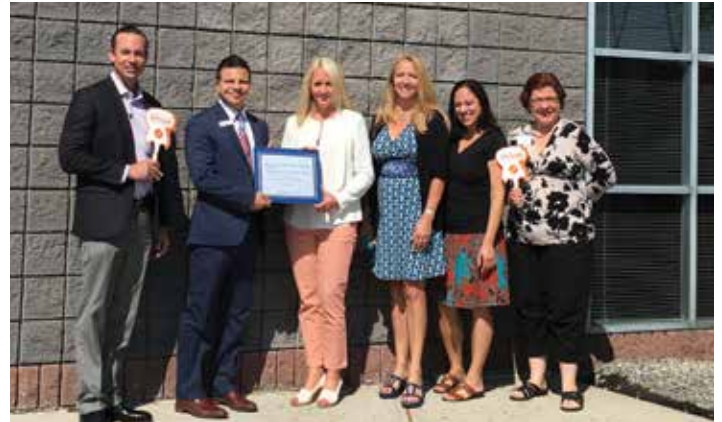
Visions Federal Credit Union , 500 Erie Blvd. W., celebrates its 50th anniversary.