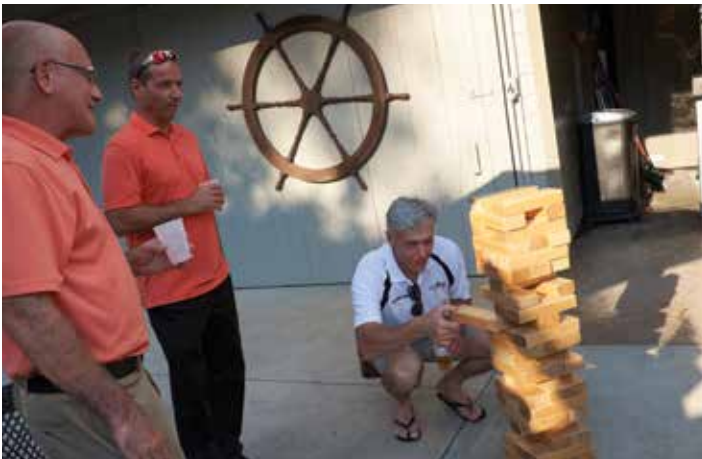
Attendees enjoy a strategic game of Jenga during CEO's annual clambake.