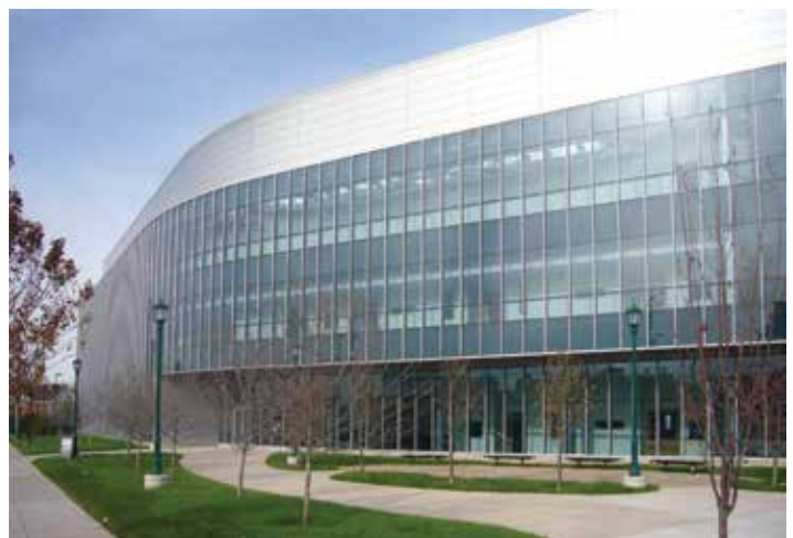
Upstate Medical University's Biotech Accelerator located at 841 E. Fayette St. in Syracuse.

The Accelerator currently hosts eight clients. Accepted clients may elect to license partial lab space (e.g., a single bench) or an entire lab. Offices and event space are also available for rent. For-profit biotech startups seeking lab space can contact 315-464-9288. To conduct Usability Testing call 315-464-9290. Direct general requests to cnybac@upstate.edu or visit www.cnybac.com .