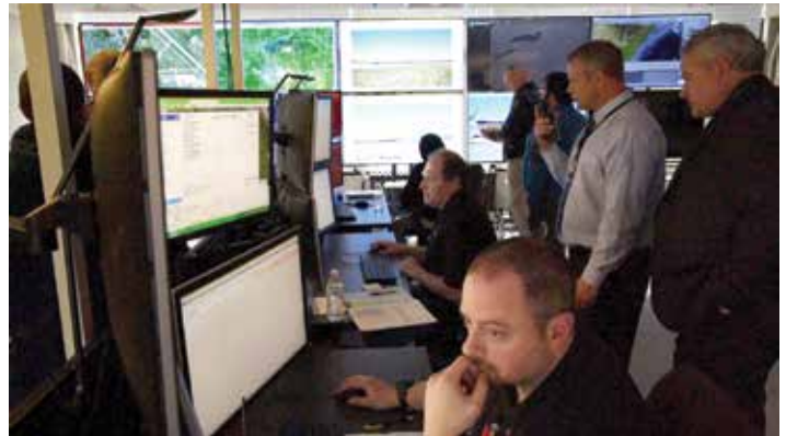
Members of the NUAIR Alliance monitor simultaneous flights at multiple sites at the newly updated UAS Operations Center at Griffiss International Airport.