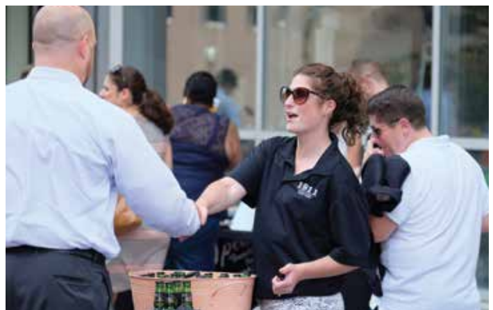
Attendees at Tech Meets Taste enjoy samples of Beak & Skiff Apple Orchard's 1911 Hard Cider. www.1911spirits.com