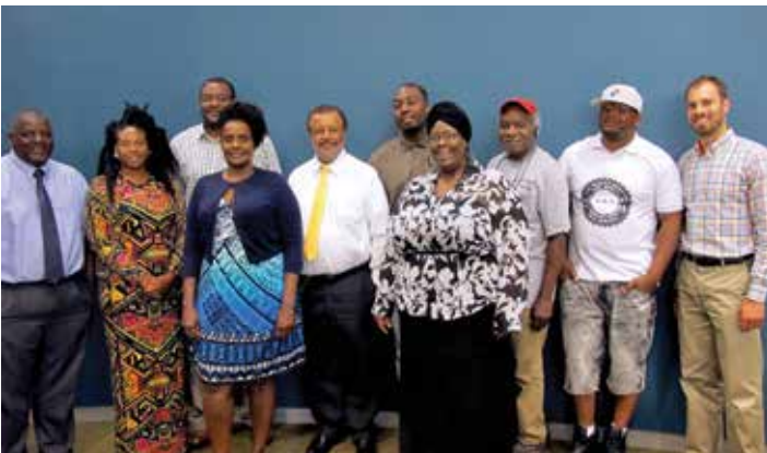
The graduates of Start It! Business Basics, a class on the essentials of starting a business, at their graduation in July at The Tech Garden.