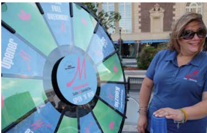
The Maplewood Suites Extended Stay offers attendees the chance to spin 'n win for prizes. www.mwsyracuse.com

More than 200 people attended the festivities on The Tech Garden patio, which featured more than 40 cafes, restaurants and startups ranging from energy solutions to legal services and distilled beverages to farmstead cheese. KMase Productions Beak & Skiff provided entertainment.