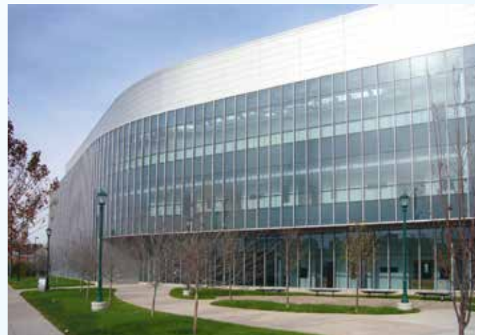
The conference will be held at the Upstate Biotech Accelerator

"Innovation ecosystem" experts will discuss biotech collaborative process to catalyze innovation.