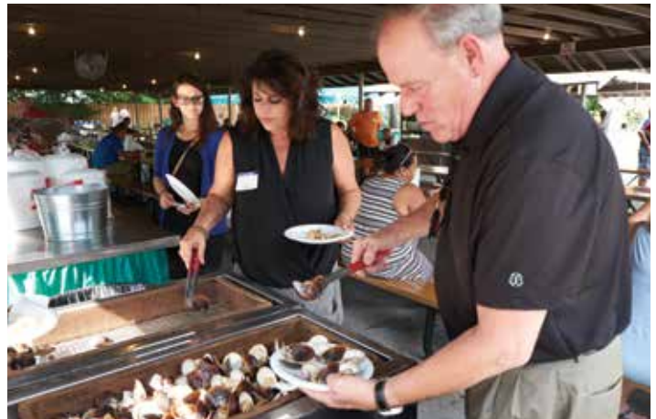
Endless clams at Hinerwadel's Grove in North Syracuse are always a hit!