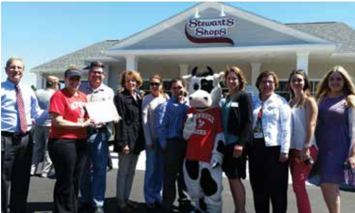
Stewart's Shops celebrates its grand opening in Baldwinsville at 120 Oswego St.