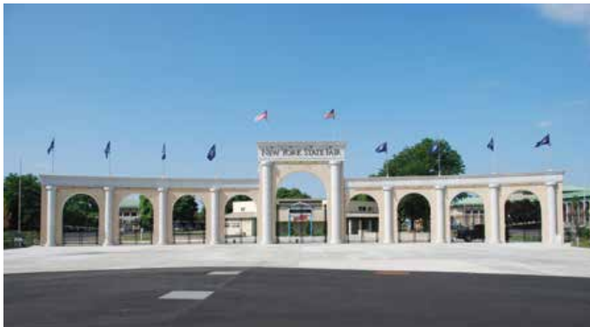
The New York State Fair’s new entrance.

“The New York State Fair has delighted New Yorkers for over a century and the $50 million transformation will ensure the fairgrounds continue to attract top-notch attractions and visitors for years to come,” Governor Andrew Cuomo said in a press release.