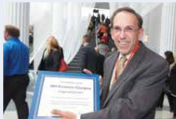
Last year's celebration celebrated 234 champions!