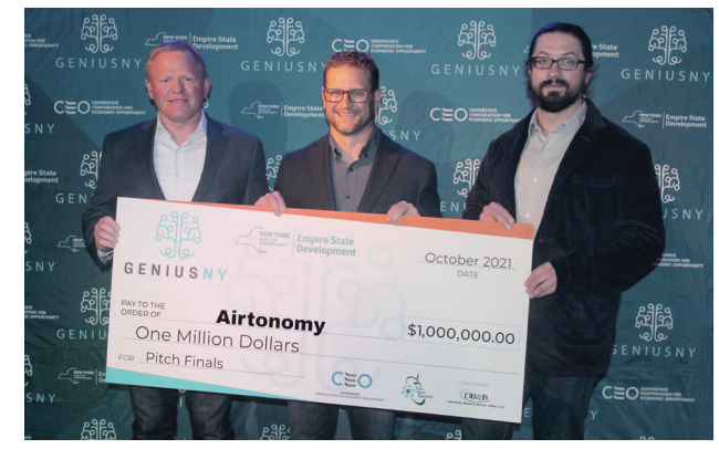
Round five winner, Airtonomy received the top prize of $1 million in October 2021. The company has seen significant growth in Central New York and has partnered with several local providers and customers. In 2022, the company plans to secure its Series A at $15 million. They continue to hire in Syracuse and work with other local UAS companies like NUAIR and Airial Robotics.

The program, which is funded by Empire State Development (ESD) and administered by CenterState CEO, has been renewed through round ten by ESD. GENIUS NY has attracted more than 26 startups to Central New York since its inception in 2017. To date, teams have raised more than $90 million in venture capital and created more than 60 upstate New York jobs.