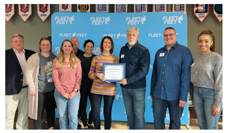
Fleet Feet Syracuse, located at 5800 Bridge St., East Syracuse, celebrates being recognized as one of the Top 50 Running Stores in the U.S. for the 16th consecutive year.