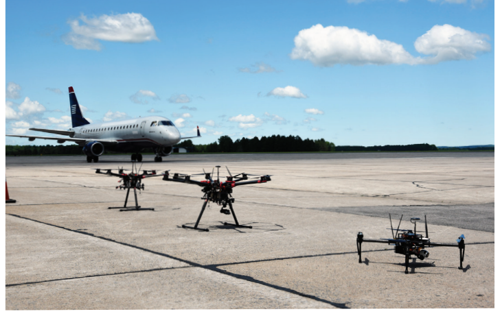
NUAIR drones at Griffiss International Airport in Rome, New York.

within New York's 50-mile Drone Corridor, managed by NUAIR. The