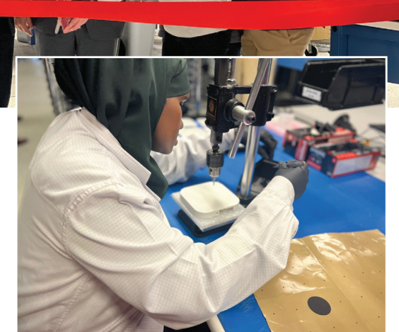
A Density employee assembles a people-counting sensor.

Density executives and local business leaders cut the ribbon at Density's new manufacturing facility in downtown Syracuse.