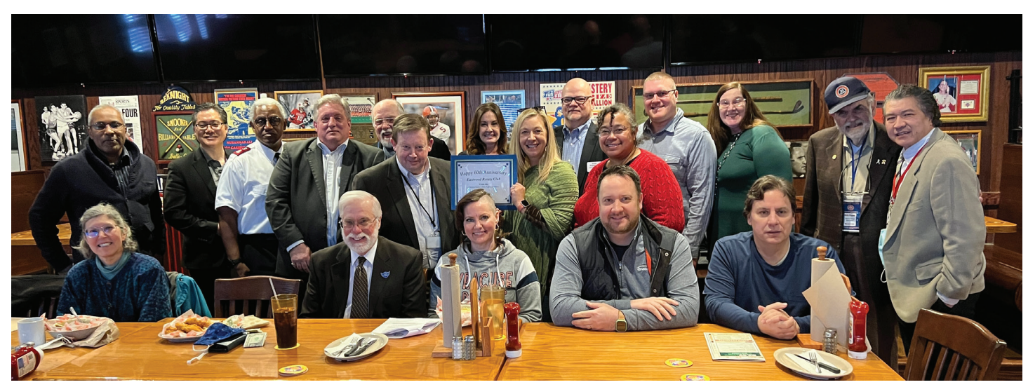
Eastwood Rotary Club, located in Syracuse, celebrates its 60th anniversary.