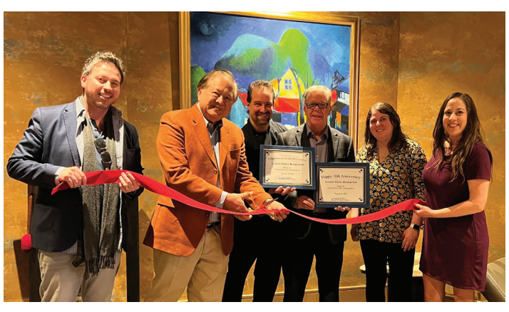
Lemon Grass Restaurant, located at 113 Walton Street, Syracuse, celebrates its relocation and 30th anniversary.