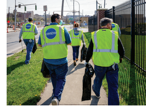
In 2021, more than 100 volunteers, including representatives from Centro, organized cleanups through downtown Syracuse neighborhoods. Organizations worked with the Downtown Committee to select a location and the Downtown Committee provided supplies.

to welcome the warm season as 350 baskets will be installed throughout Cathedral, Clinton, Hanover and Armory squares and the Heart of Downtown neighborhoods. Support the Downtown Syracuse Foundation by sponsoring a flower basket to dress streets throughout downtown. Each tax-deductible donation of $55/basket helps to foster a vibrant, thriving downtown. Those interested may mail a check to the Downtown Syracuse Foundation, Inc. at 115 West Fayette St., Syracuse, NY 13202, or access a link for credit card payments on the Downtown Committee website.