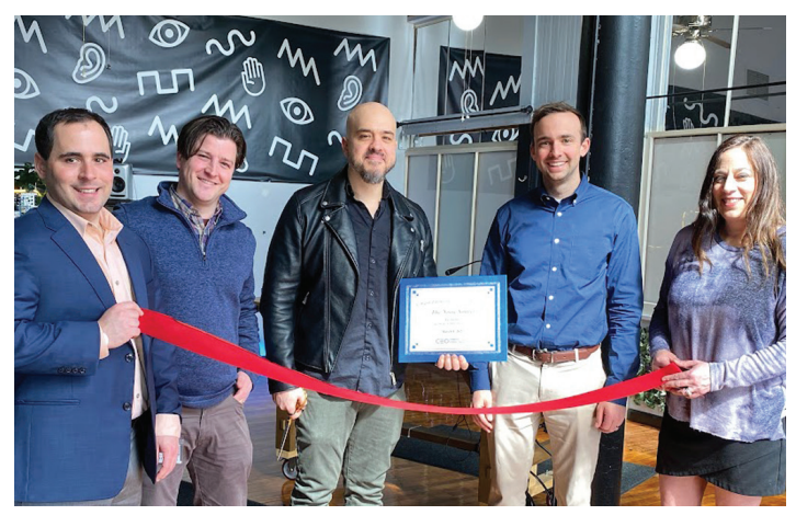
The Noise Source, located at 306 W. Jefferson St., Syracuse, celebrates its grand opening.