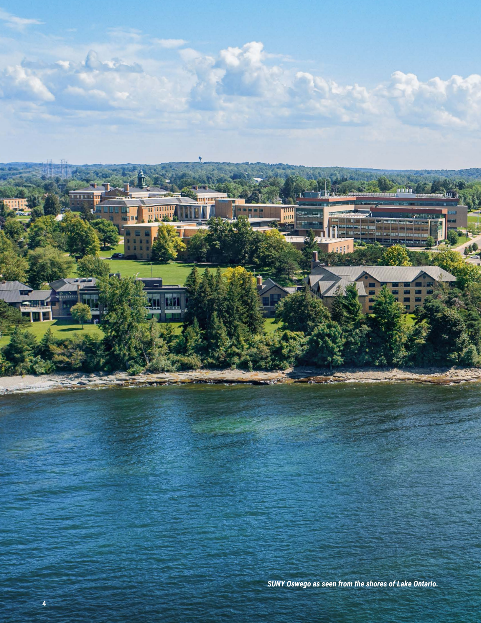
SUNY Oswego as seen from the shores of Lake Ontario.