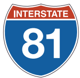
Community Grid Plus: Expanding the I-81 Conversation Beyond the Highway

CenterState CEO congratulates 15 member businesses and organizations for their outstanding achievements during the past year. CenterState CEO's Business of the Year finalists were selected from a highly competitive pool of nominations.