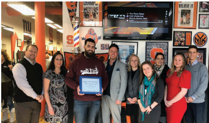
Hall of Fame Barbershop , 120 Walton St. in Armory Square, celebrates its 10th anniversary.