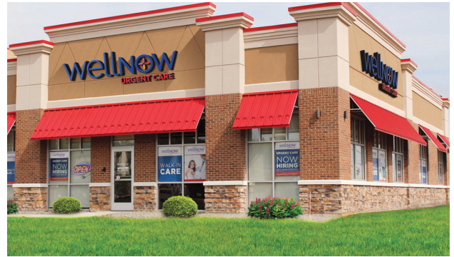
WellNow Urgent Care locations are open seven days a week with no appointment needed.

This feature of CEO Essentials spotlights local companies that are “Economic Champions” because of their success in adding jobs, expanding their products or services, gaining national recognition or contributing to the success of the region in special ways.