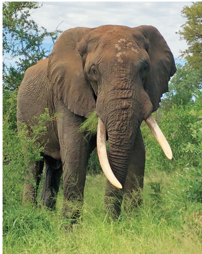
At Kruger National Park, the group enjoys an incredible up-close experience with elephants and other wildlife inside the globally renowned sanctuary.

Twenty-nine people joined CenterState CEO on a trip of a lifetime to South Africa. The trip offered first-hand insights into the new South Africa during the nation's 25th year post-apartheid. Key points in the struggle to form its new government included pivotal sites in Johannesburg and the Soweto Township. From there, the group went on safari in Kruger National Park, where they encountered the country's wildlife up close, including South Africa's "big five" — elephants, rhinos, lions, buffalo and leopards. The trip continued to South Africa's Knysna region with spectacular views of the Indian Ocean before ending in Cape Town with visits to the Winelands region, Table Mountain and the Atlantic coast. The group experienced rich culture and engaged with people throughout the country while enjoying South African cuisine and wines, discussing history, business, the nation's challenges and its hopeful future.