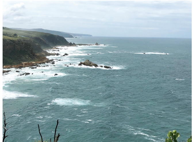
CenterState CEO travelers enjoy spectacular views of Cape Town, the Atlantic Ocean and Robben Island from Table Mountain.