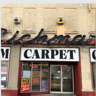
UMEA Focuses on How Opportunity Zones Can Impact Minority Communities