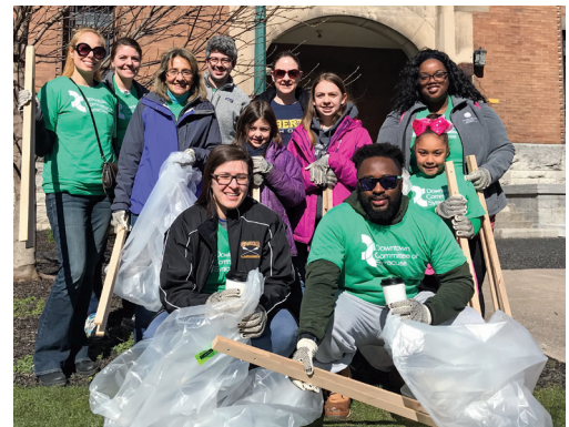
The Community Foundation of Central New York was one of about a dozen downtown organizations to get involved with the Earth Day Clean-Up last year.