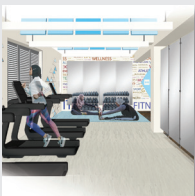
Northside Partners Collaborate to Advance Women's Wellness Center