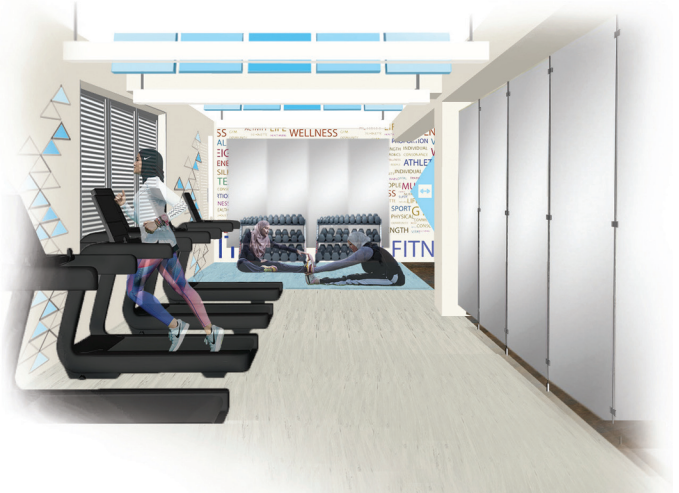
A view of the proposed exercise room at the new women's wellness center on Syracuse's Northside.