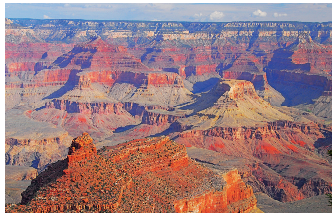
The Grand Canyon is one stop among many on the Canyon Country tour in September 2019.

CenterState CEO's next adventure heads to America's Canyon Country in Arizona and Utah, September 11 to 18. Highlights include Scottsdale, Oak Creek Canyon, Kaibab National Forest, the Grand Canyon, Lake Powell, Bryce Canyon National Park, Zion National Park and Las Vegas. The trip includes roundtrip air from Syracuse Hancock International Airport, air taxes and fees/surcharges, hotel transfers and 10 meals. For more information, contact Jennine Lombardi at 315-701-2648 or jlombardi@nyaaa.com .