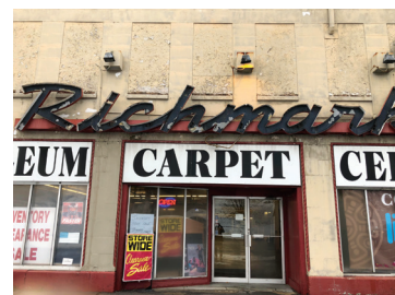
The Richmark building, located at 1641 E. Genesee St., in Syracuse, is a designated Opportunity Zone and the future home of Interior Innovations.