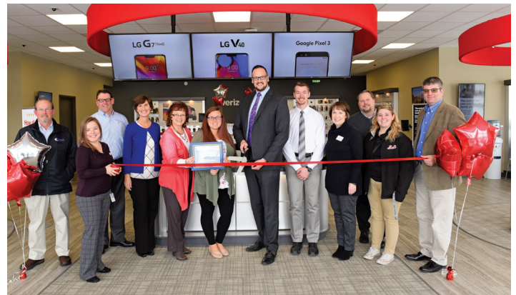
Cellular Sales held a grand opening celebration at its new store located in Fairmount at 3705 W. Genesee St.