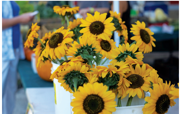
Project Bloom, presented by Pathfinder Bank, and the Oswego-Fulton Farmers Markets, presented by Oswego Health, return to the community this year.