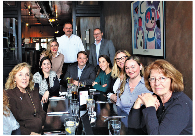
Cheers! The Greater Oswego-Fulton Chamber of Commerce celebrates Oswego County Restaurant Week with CenterState CEO's business development team.