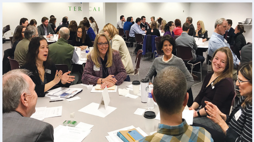
Speed Networking offers coffee, connections, conversation and more.

See the events calendar on page 14 for upcoming opportunities to learn and improve your business.