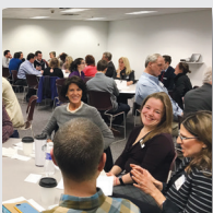
CenterState CEO Events