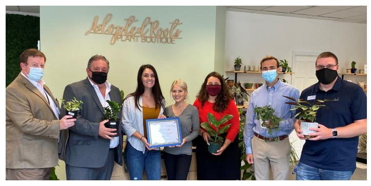
Adopted Roots, located at 410 S. Warren St., Syracuse, celebrates its grand opening.