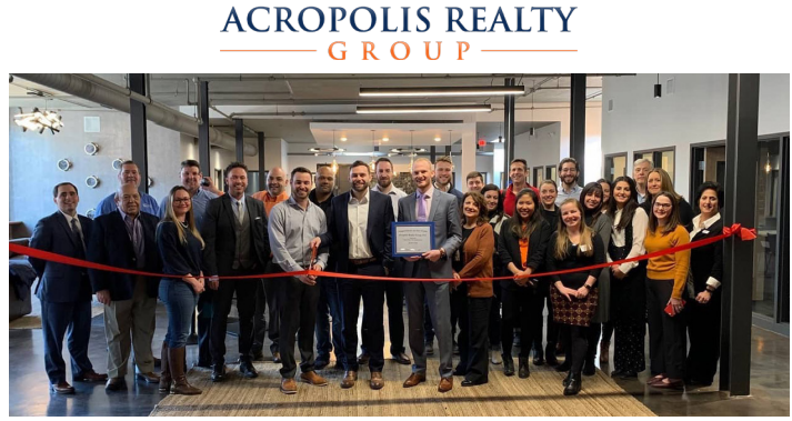
CenterState CEO Ambassadors celebrate the Acropolis Realty Group's relocation in 2020.

Acropolis Property Management has more than 500 units under management in the Syracuse area and is the exclusive leasing agent for Washington Place, the newest luxury apartments in downtown Syracuse with more than 200 units. Acropolis Realty Group is the