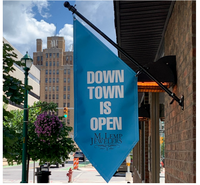
One of the first flags was installed at M. Lemp Jewelers, located at 300 S. Warren St., bringing a pop of color to the streetscape.

The downtown Syracuse streetscape looks a little more colorful! To provide visual cues that downtown is open for business, dozens of streetlevel businesses ordered a "Downtown is Open" flag. The first flags were installed in June 2021, and the third round went up last month. Funding for the flags was granted to the Downtown Syracuse Foundation through a COVID-19 relief program provided by Syracuse Economic Development Corporation (SEDCO). Together, they showcase all the businesses that have reopened during the pandemic and contribute to a celebratory streetscape. The SEDCO funding has also allowed for downtown businesses to collaborate with other businesses located in the city to host an event or special promotion designed to bring visitors into downtown Syracuse through a Cooperative Marketing Grant program.