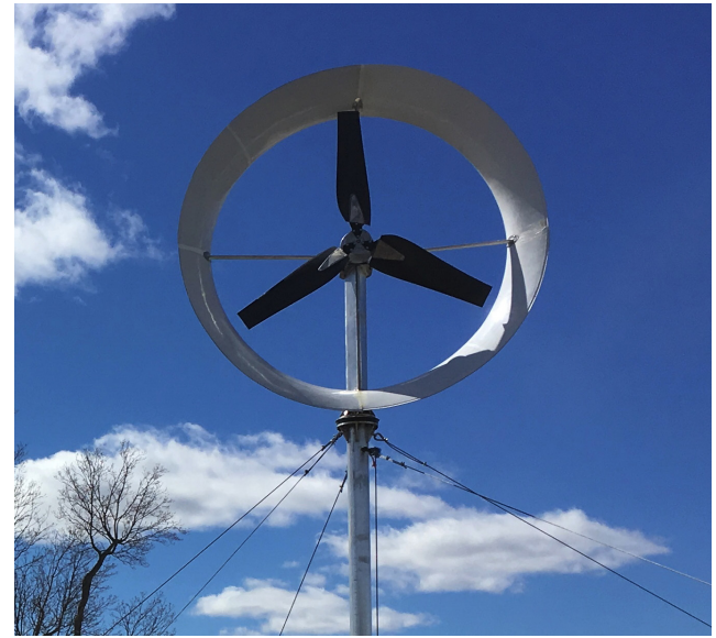
Ducted Wind Turbines Gen 1 prototype.