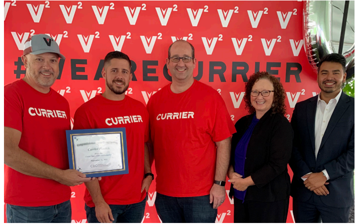
Currier Plastics, Inc. , located at 101 Columbus St., Auburn, celebrates its 40th anniversary.