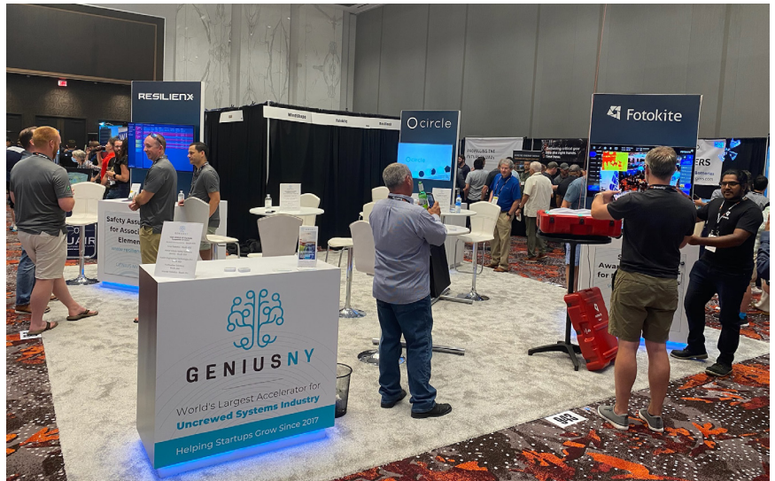
GENIUS NY teams and CNY stakeholders work the trade show floor at the Commercial UAV Expo — the leading international trade show and conference focusing on the integration and operation of commercial UAS — in Las Vegas, Nevada.

Judges will award one company the grand prize of $1 million, based on a five-minute pitch and Q&A. The remaining four teams will each receive $500,000, for $3 million in total awards. The event is free and open to the public, though registration is required. Learn more and purchase tickets.