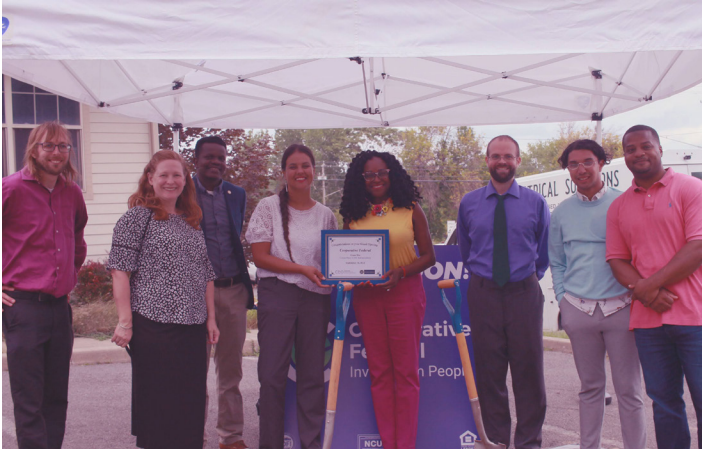
Cooperative Federal Credit Union , located at 1816 Erie Blvd. E., Syracuse, celebrates the grand opening of its new location, in partnership with the Upstate Minority Economic Alliance.