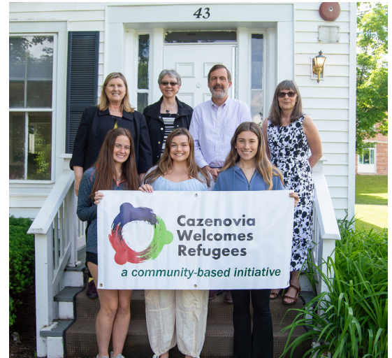
Cazenovia College together with Cazenovia Welcomes Refugees (CWR) and InterFaith Works welcomes a family from Afghanistan to Cazenovia. The College, CWR and InterFaith Works teamed up to renovate a college-owned building to return the two-story structure back into a single-family home. After nine months of reconstruction, the resettlement family moved in this summer.