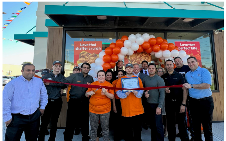
Popeyes (owned by Liberty Restaurants Holdings), located at 7980 Brewerton Road, Cicero, celebrates its grand opening.