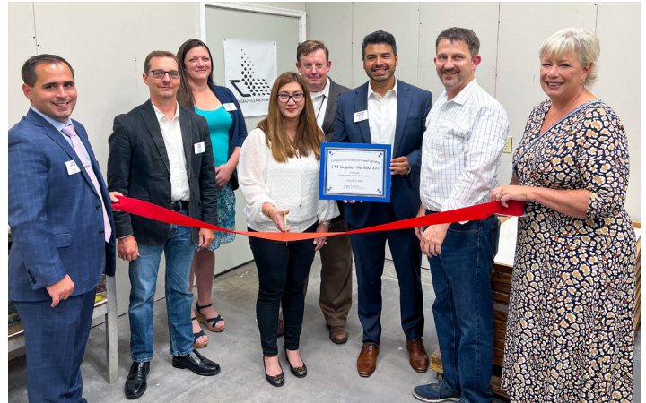
CNY Graphics Machine, LLC , located at 3550 Burnet Ave., East Syracuse, celebrates its grand opening.