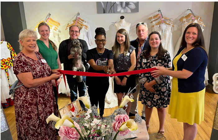
Elegance with a Twist Bridal Boutique , located at 425 S. Warren St., Syracuse, celebrates its grand opening along with the Downtown Committee of Syracuse and the Upstate Minority Economic Alliance.