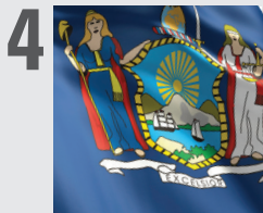
4 New York’s $7B+ Unemployment Insurance Fund Deficit: What it Means for Your Business