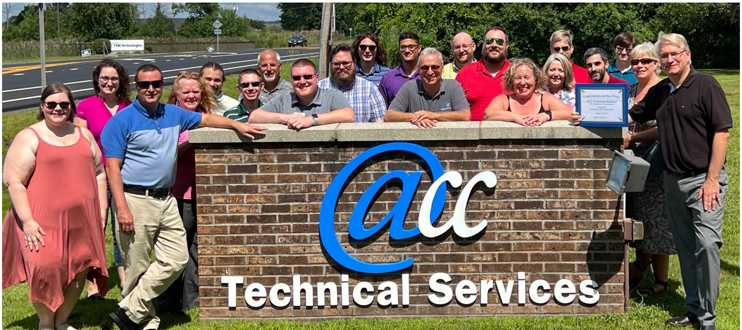
ACC Technical Services , located at 6400 Fly Road, East Syracuse, celebrates its 30th anniversary and new location.