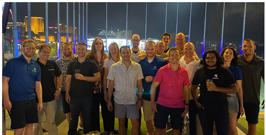
GENIUS NY teams, staff and supporters connect and unwind after a productive day at the expo.