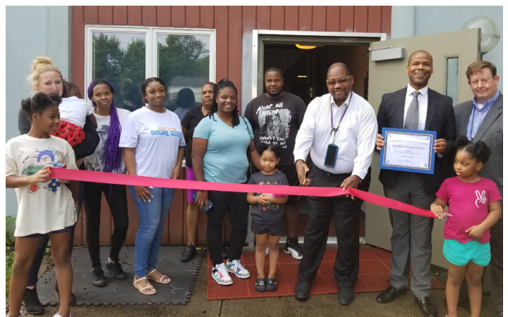
Kool Kidz Daycare Center , located at 1816 Midland Ave., Syracuse, celebrates its grand opening in partnership with the Upstate Minority Economic Alliance.