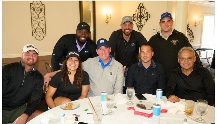
Equitable was the lucky foursome winner with a score of 57.

All winners received a Syracuse prize pack.