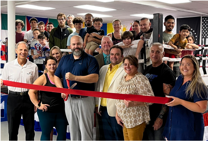
Oswego Boxing Club, located at 135 E. First St., Oswego, celebrates its grand opening.