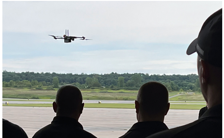
Public safety officials viewing a drone demo at Griffiss International Airport.

Griffiss International Airport in Rome, New York, home to the New York UAS Test Site, one of only seven FAA-designated UAS test sites in the country, hosted the second day of the summit. The event filled the former military airplane hangar with vendors showcasing the latest drone technologies designed specifically for public safety operations. Vendors conducted live demonstrations of their technologies and services including different drone platforms and payloads, cameras, counter UAS systems, livestreaming capabilities, software and more.