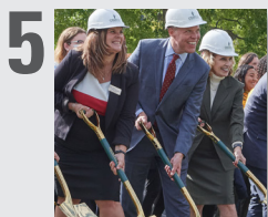
5 The Economic Impact of Central New York’s Anchor Institutions