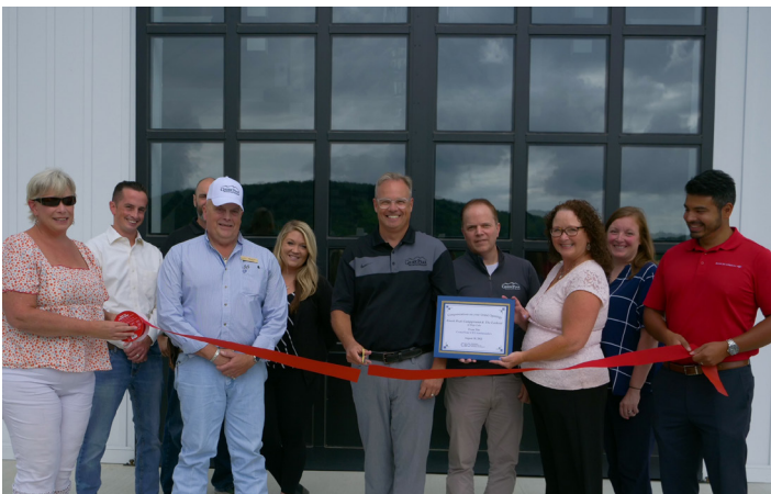
Greek Peak Mountain Resort , located at 2000 NY-392, Cortland, celebrates two grand openings: Campground at Hope Lake and The Lookout — a wedding and events venue.