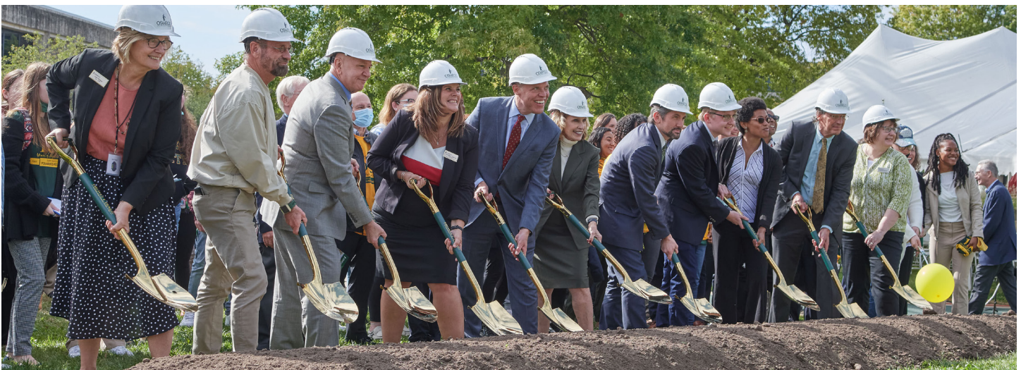
SUNY Oswego breaks ground on the $80 million Hewitt Hall renovation last year that will turn the former student union into a state-of-the-art home for Oswego's School of Communication, Media and the Arts. The project is expected to be completed in 2023.