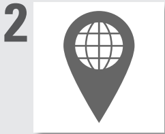
2 CEO Expands Real Estate Database: Add Your Site