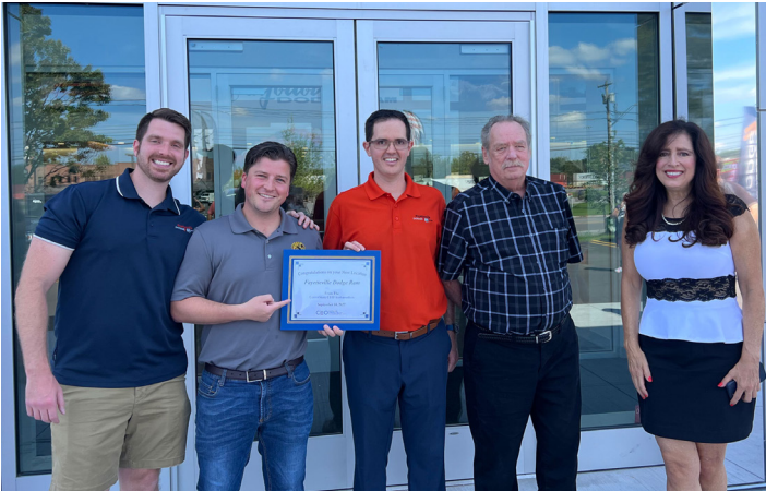
Fayetteville Dodge Ram , located at 6010 Galster Road, East Syracuse, celebrates the grand opening of its new location.