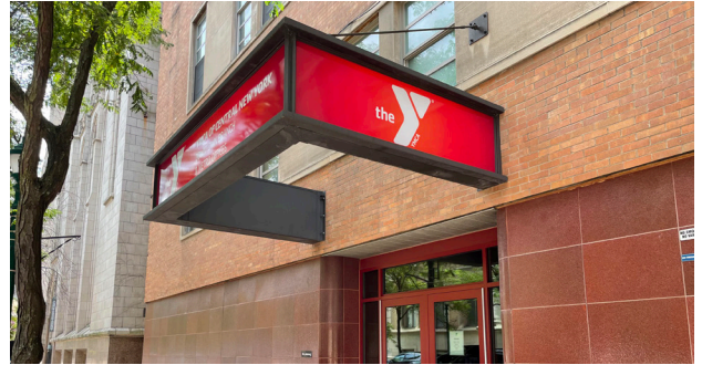
The YMCA of Central New York (downtown and metro office) is located at 340 Montgomery St., in Syracuse.

This feature of CEO Essentials spotlights local companies that are "Economic Champions" because of their success in adding jobs, expanding their products or services, gaining national recognition or contributing to the success of the region in special ways.